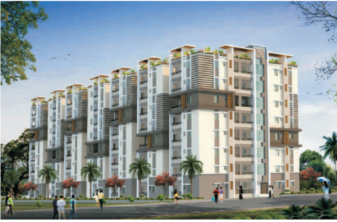
Block - A