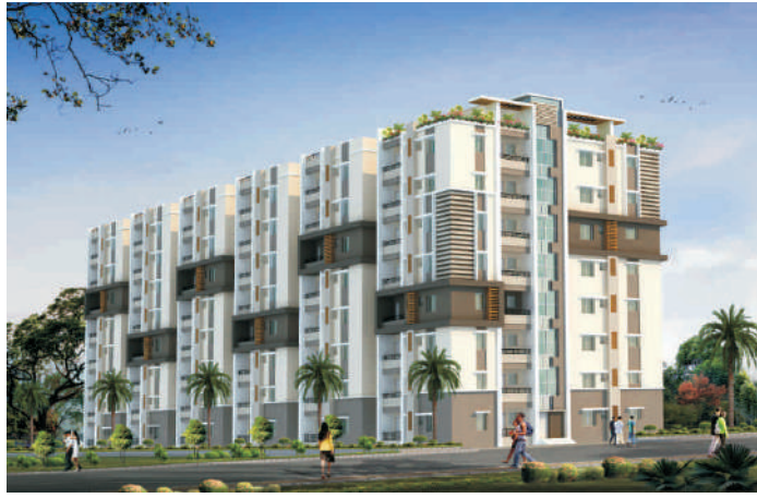
Block - B