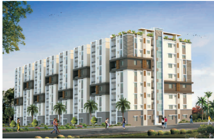
Block - E